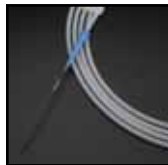
MAXXWIRE® Guide Wire