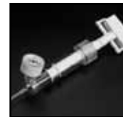
ENDOTEK BIG60™ Inflation Device